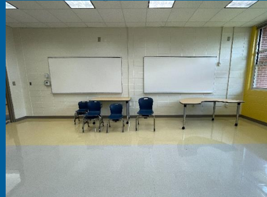
Classroom Furniture currently moving in