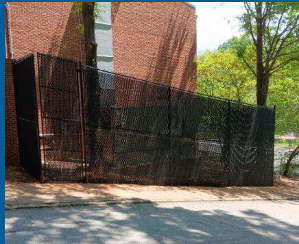
Install Fencing for Outside Air Units