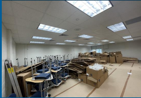
New Classroom Furniture Setup Prep