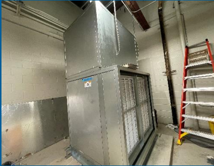
Install Air Handling Unit in the Gym