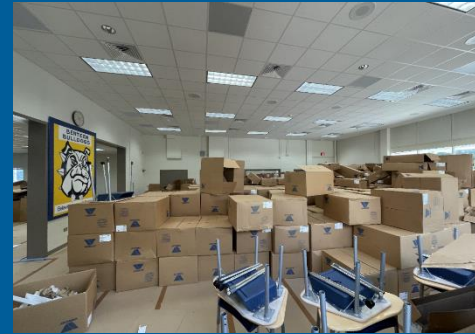
New Classroom furniture delivery