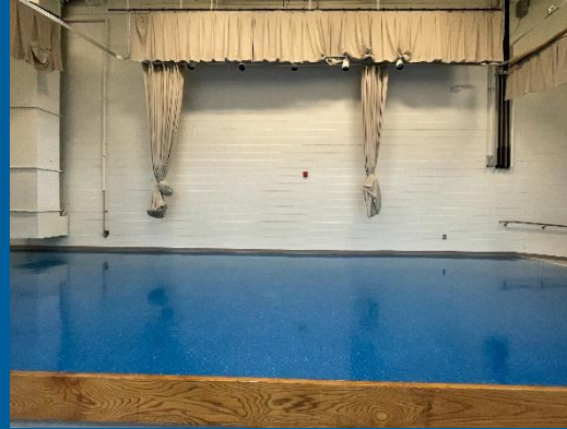
Wax Gymnasium's Stage