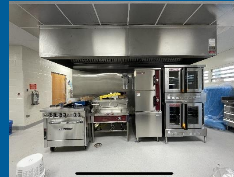
Installation of Kitchen Equipment